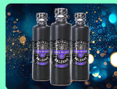
Riga Black Balsam Currant