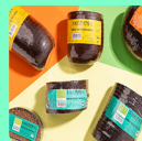
Ķelmēni dark bread