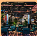
Burzma food hall