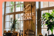
Rocket Bean roastery