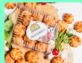
Liepkalni baked products