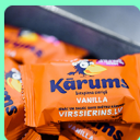
Kārums dairy snack