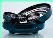
an & angel luxury tableware