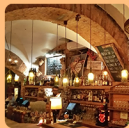
Folk club Ala